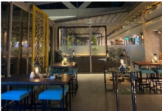
Prior Evening Reception venue

Our event utilizes the Diamond Ballroom which can accommodate our target audience of around 80 delegates and 20 speakers as well as house our sponsors' exhibits in the ballroom foyer. The ballroom can be divided to accommodate our separate program streams. Lunch will be served in the ballroom or Les Cuisines Restaurant.