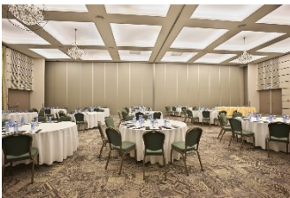
Main conference room