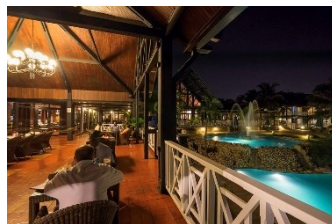
Prior evening reception venue