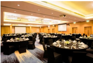
Main conference room

The exhibition area will be outside the main conference room and will also serve as the refreshments area. Lunch will be served in Soko Restaurant.