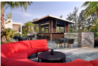
Outdoor terrace of Soko Restaurant